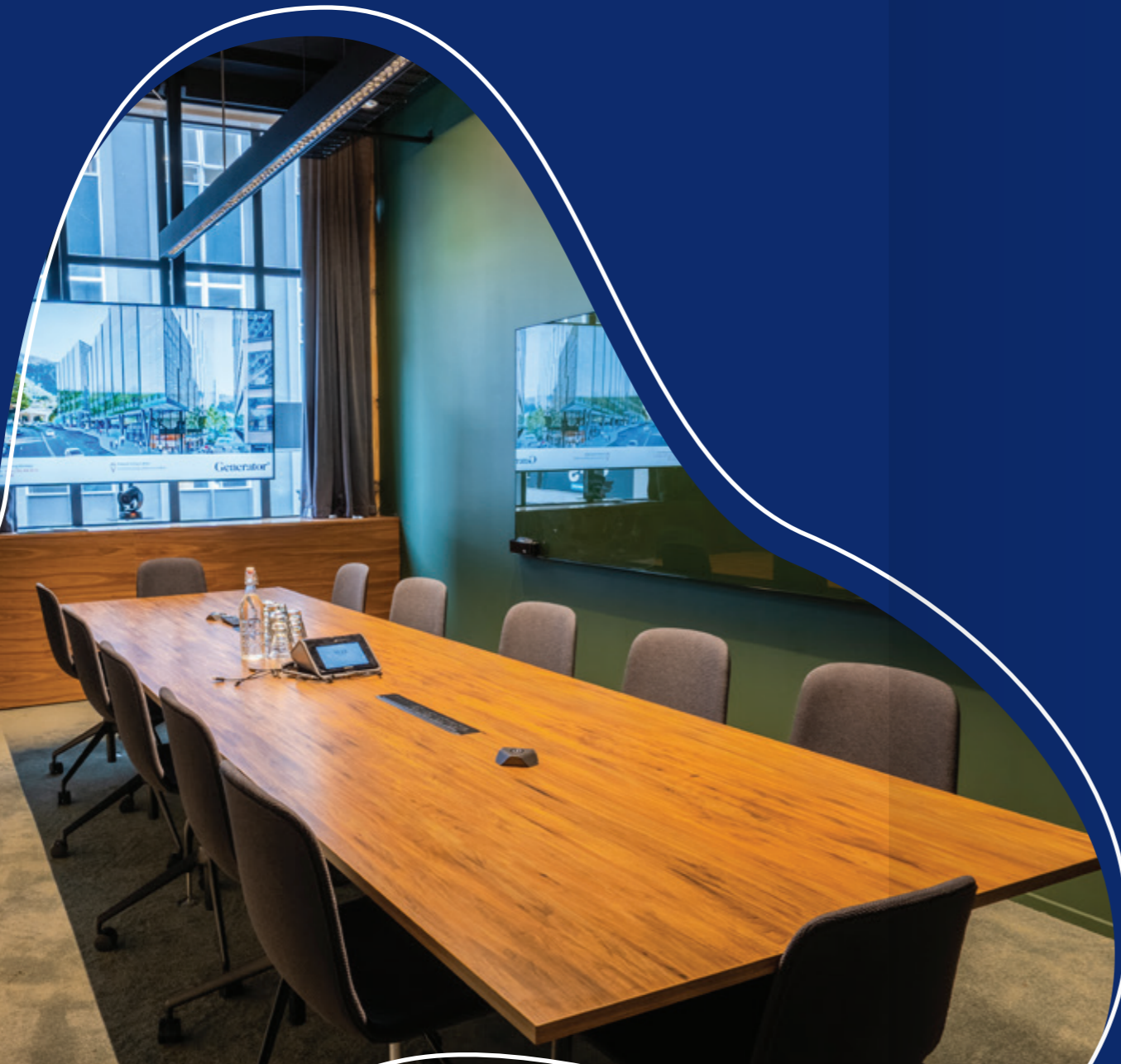
30 Waring Taylor Street