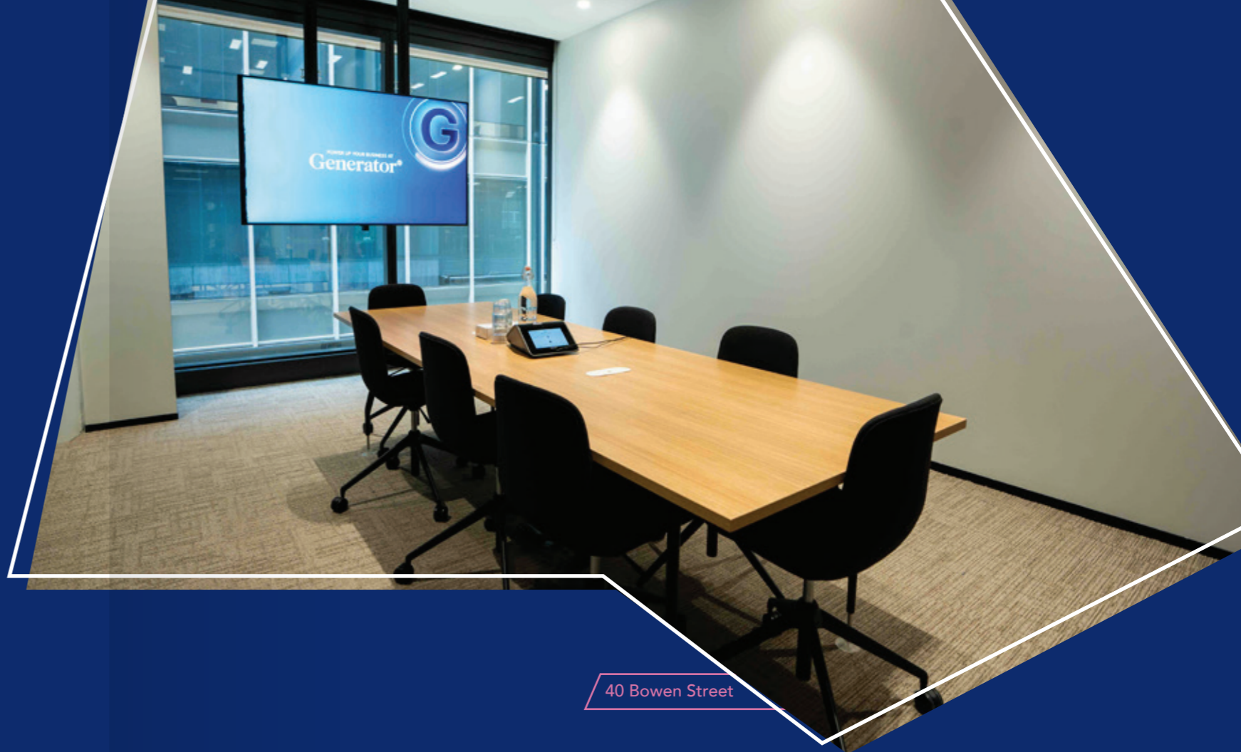
40 Bowen Street