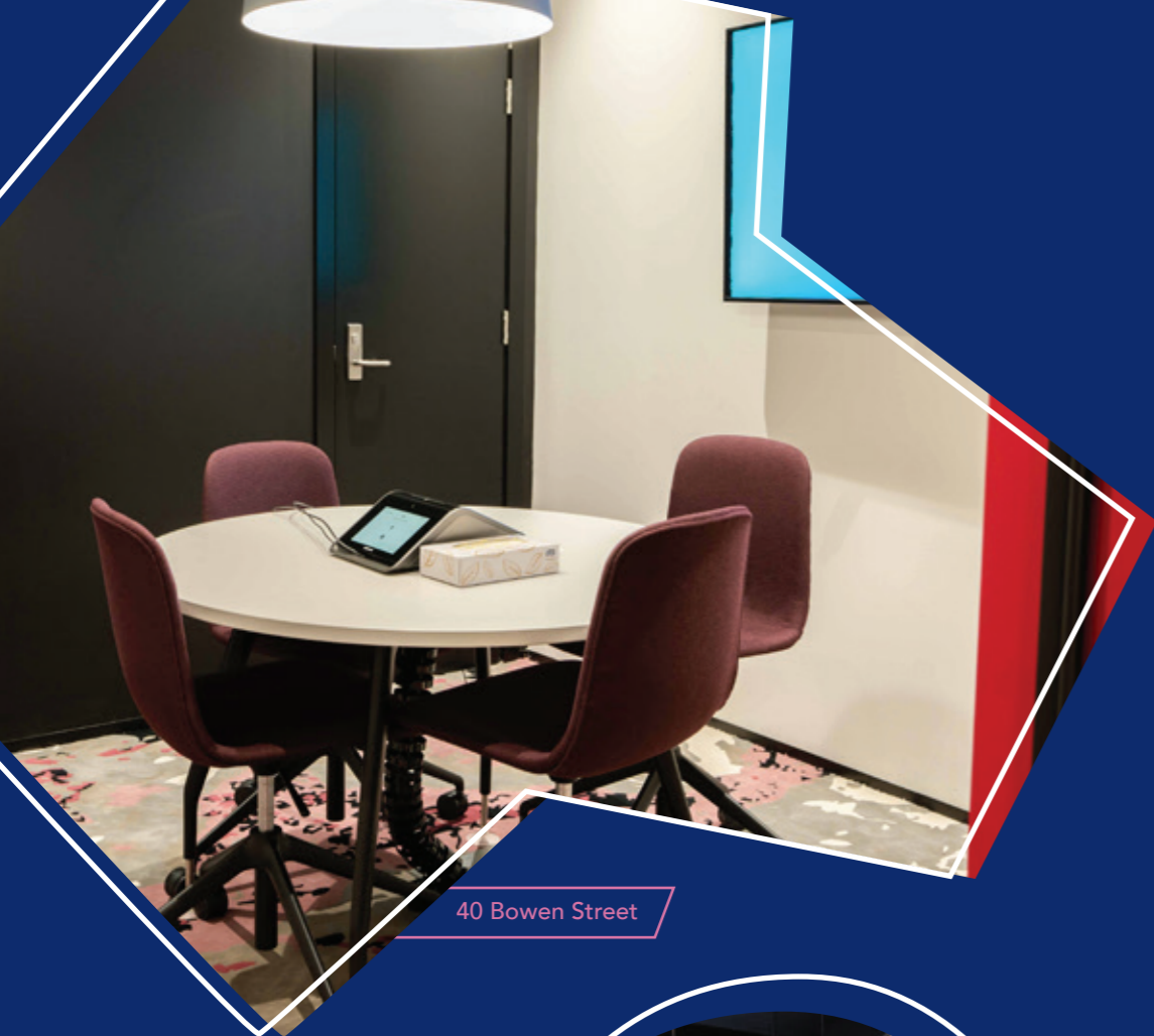
40 Bowen Street