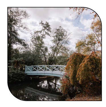
EXPLORE THE GARDENS

Our beverages are charged on consumption or a cash bar for your guests. Make your selection from our beverage menu, or trust our house range to suit your tastes!