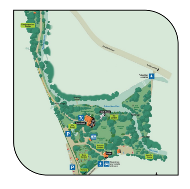
PARKING & ACCOMODATION

Talk to us about having your table set outside, in front of the Homestead.