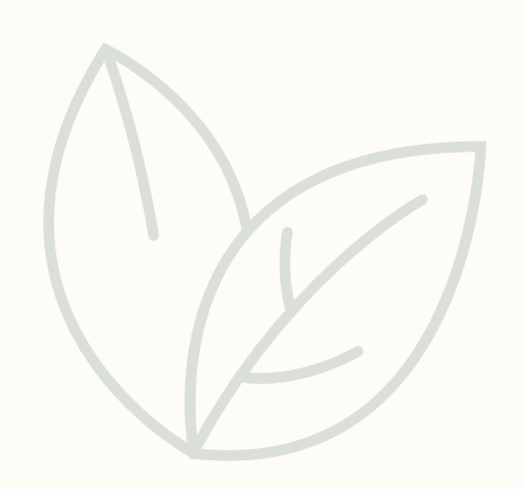
Step 3: Add On Extras

Work with our event team to build a bespoke food, beverage and staffing package to suit your event budget.