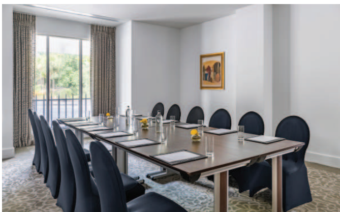
Gallery Room II